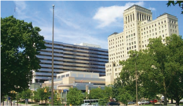
Allegheny General Hospital 320 East North Ave. Pittsburgh, PA 15212 412.359.3131