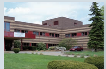
Canonsburg General Hospital 100 Medical Blvd. Canonsburg, PA 15317 724.745.6100

WPAHS provides orthopaedic and sports medicine services to the Pittsburgh Pirates and many area school districts.