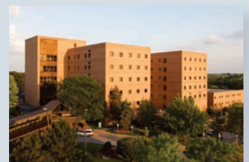
Forbes Regional Hospital 2570 Haymaker Rd. Monroeville, PA 15146 412.858.2000