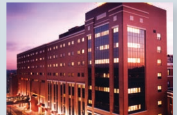
The Western Pennsylvania Hospital 4800 Friendship Ave. Pittsburgh, PA 15224 412.578.5000