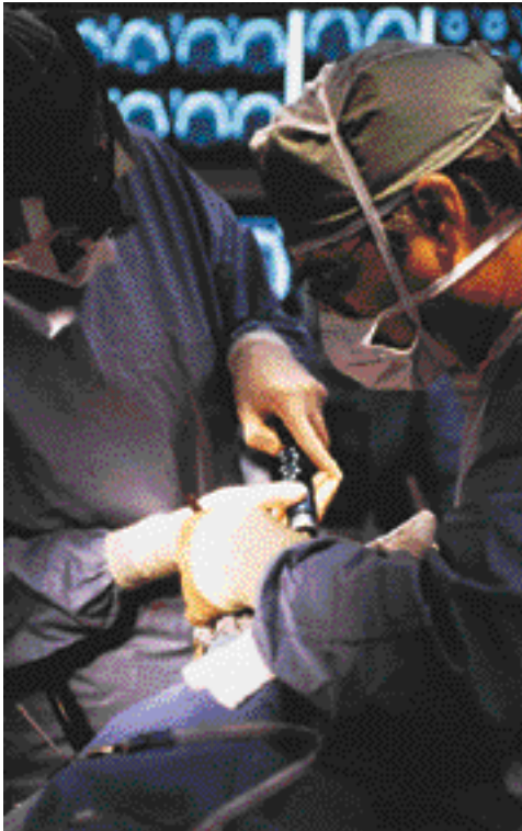
Center for Neuro-Oncology

that contribute to their in-depth educational program. These include a school-based health center and a home visit program, which allow students to understand the role of the environment in overall patient health and wellness.