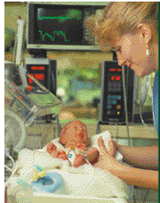
Neonatal Intensive Care Unit

Building upon its 152-year history as a regional and national leader in health care, The Western Pennsylvania Hospital is proud of its achievements and is focused on continuing to provide the highest quality of health care and service into the next millennium.